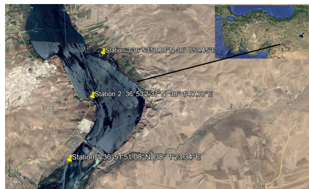
Figure 1. Location of samplingstations in Karkamış Dam Lake.

In Karkamış Dam Lake, 43 species were found, including 28 Rotifera, 10 Cladocera and 5 Copepoda groups. Based on the