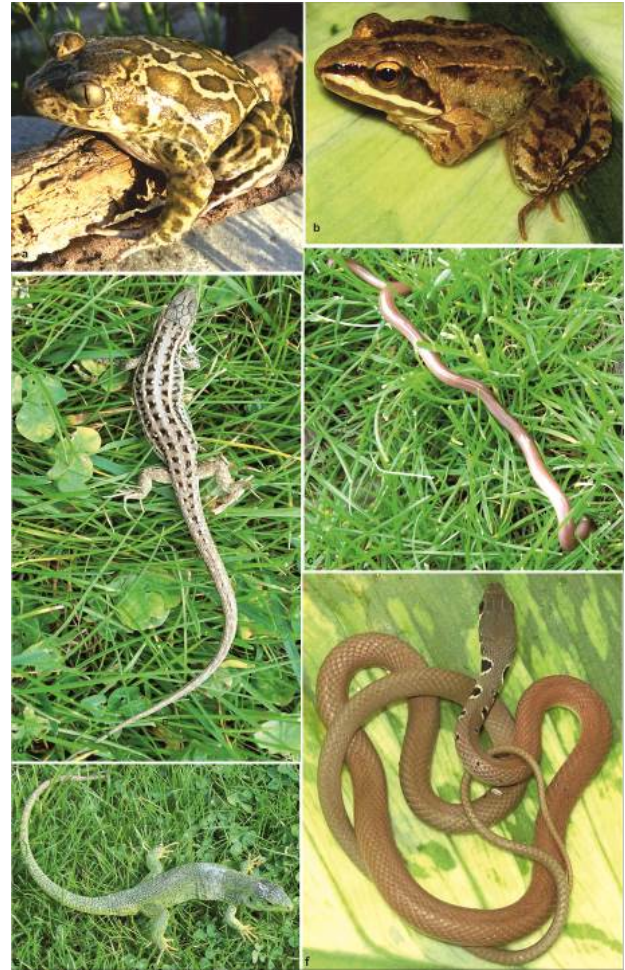
Figure 2. General views of specimens of Pelobates syriacus (a), Rana macrocnemis (b), Typhlops vermicularis (c), Parvilacerta parva (d) and Lacerta trilineata (e), Platyceps najadum (f) from Başkomutan Historical National Park.