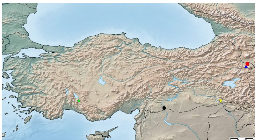
Figure 1. Scorpion sampling sites across Turkey country. Circle: Buthacus tadmorensis (Simon, 1892); star: Aegaobuthus gibbosus ; square: Mesobuthus eupeus ; triangle: Olivierus caucasicus ; inverted triangle: Androctonus turkiyensis .

The cannibalism events here were observed during a nocturnal field study (22:00-02:30 h) between 2014 and 2022 in different sites across Turkey (Fig. 1). After photographing the interactions between the scorpions, the animals were collected for later identification through pertinent literature (Cain et al. 2021, Fet et al. 2018, Kovařík 2019, Kovařík et al. 2022, Yağmur 2021). Voucher specimens were deposited in the Zoology Museum of Alaşehir Vocational School, Manisa Celal Bayar University, Manisa, Turkey (AZMM)