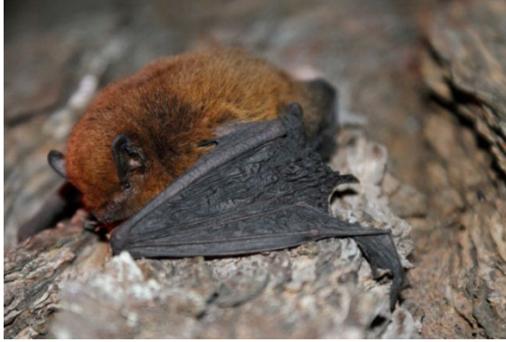
Figure 1. Pipistrellus maderensis in the wild.