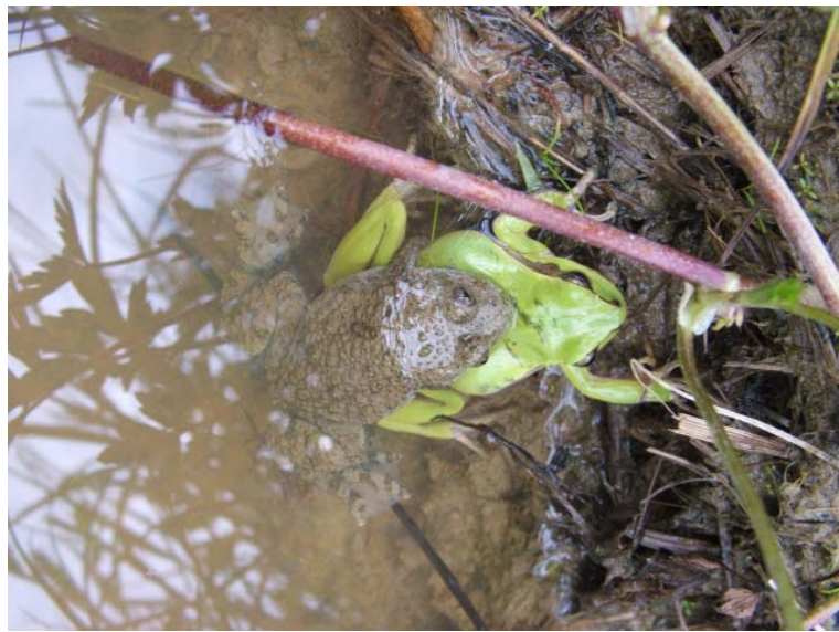
Figure no.4 A male Bombina variegata clasping a female Hyla arborea . No interspecific spawning was observed (Photo T. Hartel, Breite, Sighișoara).

suggest this is a strategy to increase the probability to finding a mate: being resident in a period when most of females are searching for new ponds (in rainy years) could be more advantageous than being migrating. However a large percentage of males were found to be migrating in rainy years as well (Hartel, unpublished data).